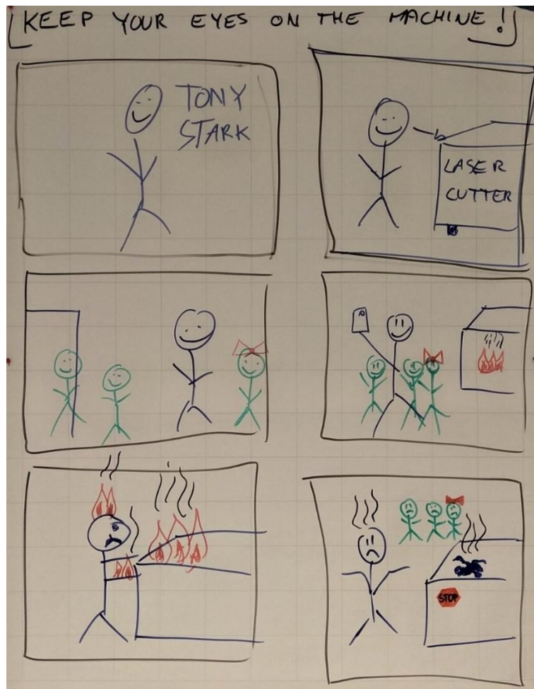
Storyboard 3: Keep your eyes on the machine ft. Iron Man

Group 3 created a storyboard for the rule "Keep your eyes on the machine". The team centers their story around both a strong character and a slice-of-life situation. The situation is humorous and suits the character. Tony Stark, the main character, aka Iron Man, comes happily to the lab to laser cut a part for his new Iron Man suit. He meets some of his fans in the lab while he is doing the laser cutting. His fans ask for a selfie with him and Tony moves away from the machine to take a selfie with his fan club. When their eyes are not on the machine, the laser cutter catches fire. Tony Stark tries to extinguish the fire, but himself catches fire. In the end, the fabricated part, the laser cutter, and his reputation are all ruined. His fan club is not amused: Tony Stark is not anymore cool. This storyboard uses a famous character, humor, and drama. Everybody should follow the safety rules in the lab. Not following the rules is not cool.